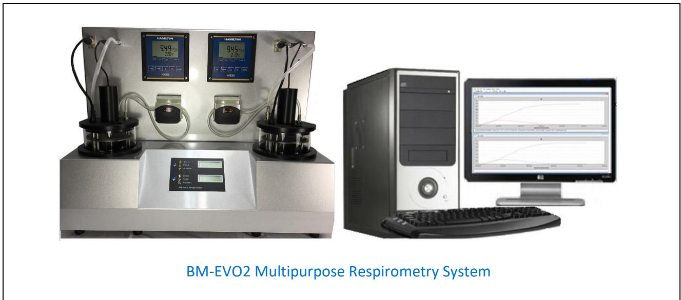
BM-EVO2 Multipurpose Respirometry System