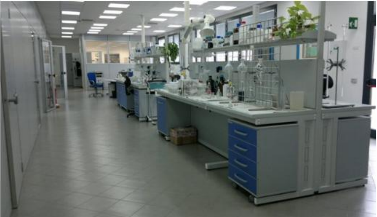
Laboratory of Consorzio Aquarno SpA

The most important points for the decision to purchase the BM-EVO2 were the fact that the BM-EVO2 respirometer is equipped with two reactors and its special flexibility to cope with different types of applications.