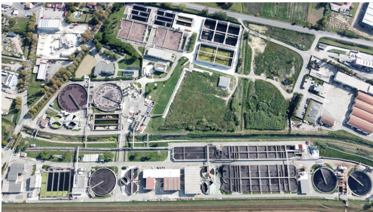
Wastewater Treatment Plant - Consorzio Aquarno SpA

While the treatment of urban wastewater is fairly standardised, most of the research and experimentation efforts for innovative solutions have been carried out on the treatment of industrial wastewater. This is due to the particular composition and recalcitrance to purification of this type of wastewater where, thanks to the constant commitment of internal staff and research projects financed by public and private funds, Consorzio Aquarno has succeeded in developing an optimised biological treatment with a minimum consumption of chemicals.