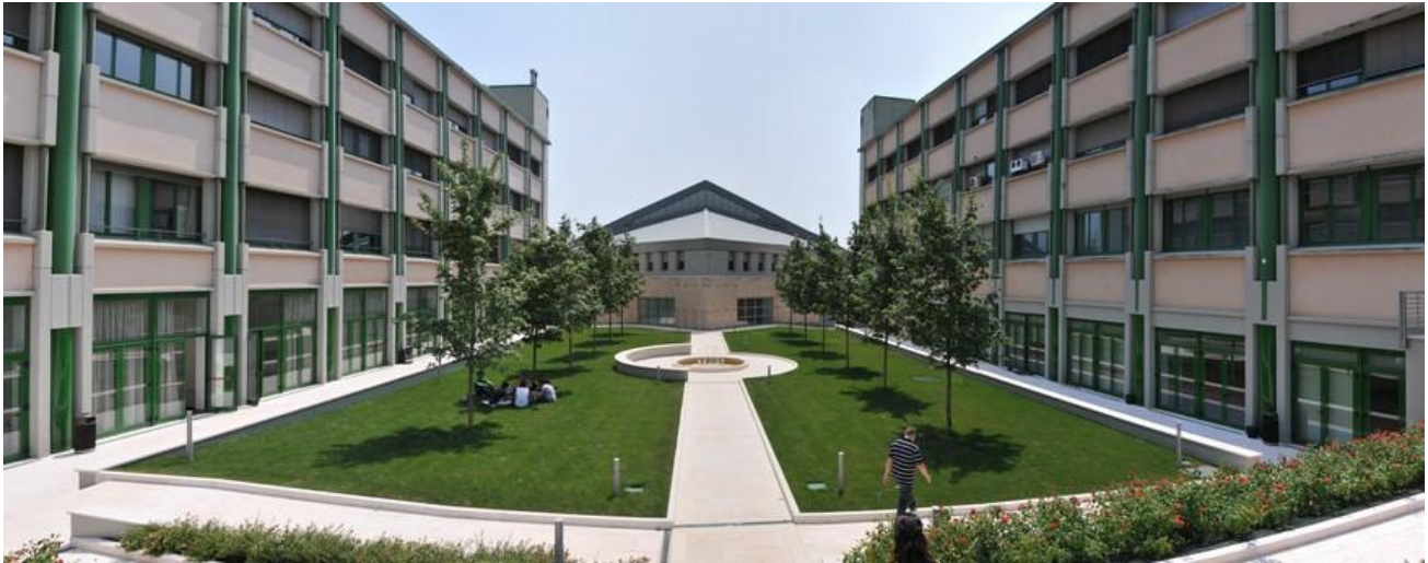
University of Verona