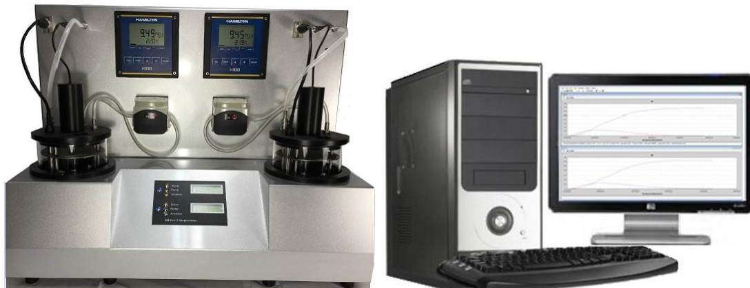
BM-EVO2 Multipurpose Respirometry System