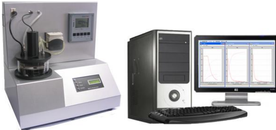
BM-EVO Respirometry system

Avantor Performance Materials, LLC acquires a SURCIS BM-EVO Multifunction Respirometry System for its Center Valley facility in Pennsylvania (US).