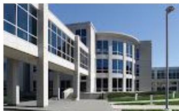
Avantor - Centro de I&D en Center Valley - Pennsylvania

Avantor is a world-leading global provider of integrated and customised solutions for the life sciences and high-tech industries. In 2017, Avantor acquired VWR, the world's largest independent provider of product, supply chain and service solutions for laboratory and manufacturing customers.